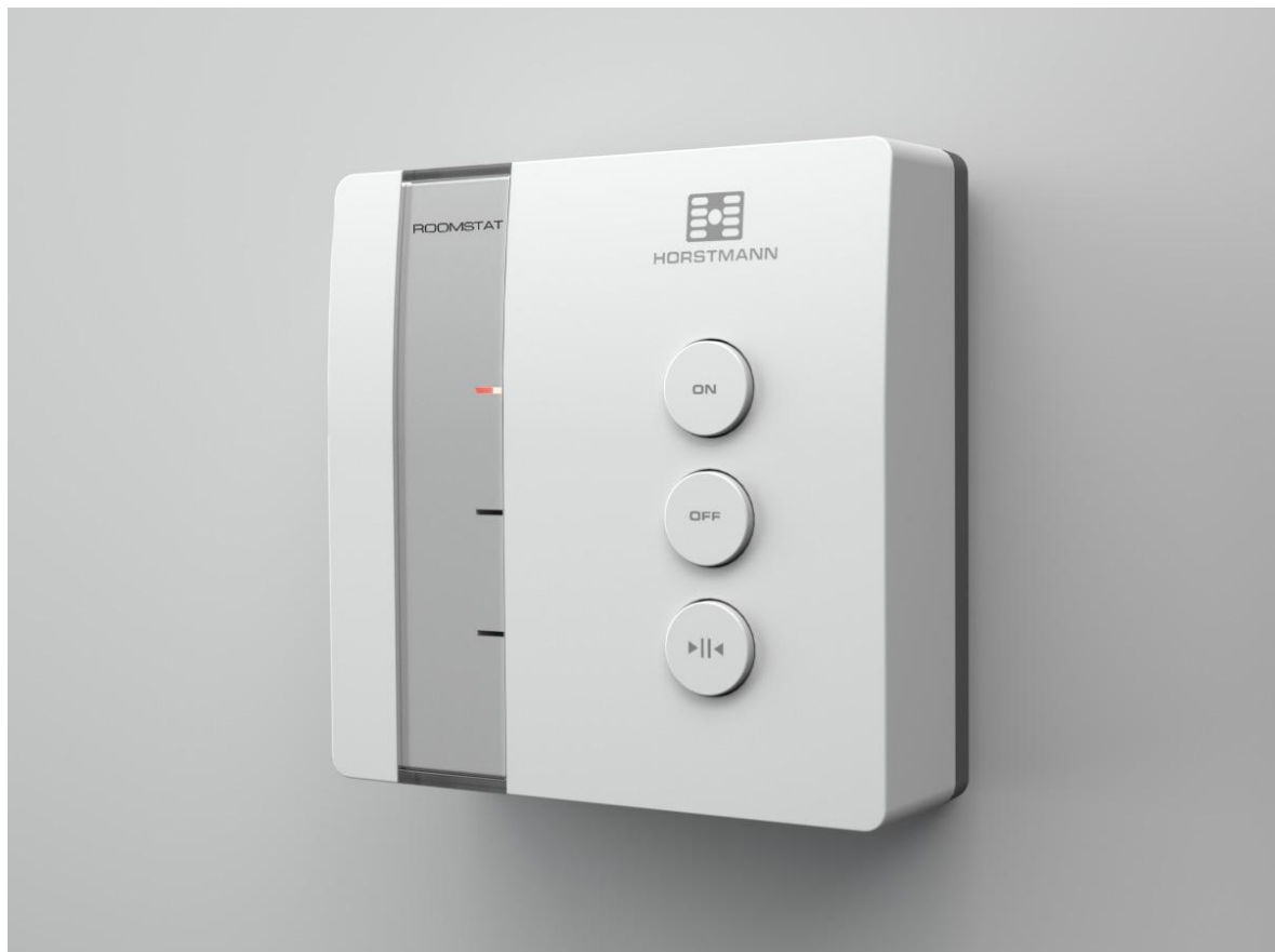
Figure 3 – Front View of ASR