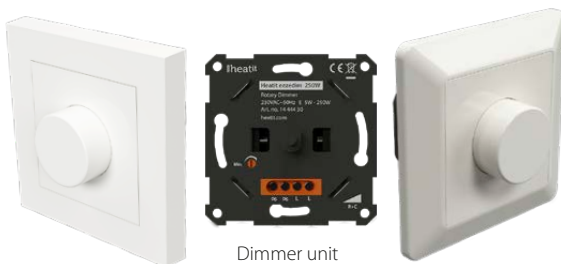
1x White RAL 9003 plastic kit