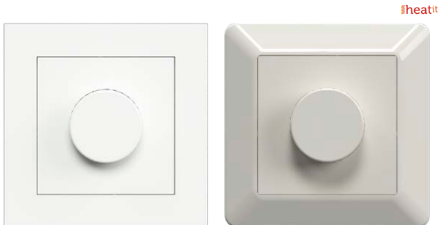
White RAL 9003